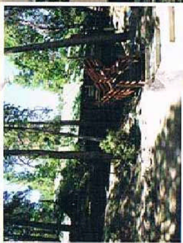
Lions Camp at Teresita Pines