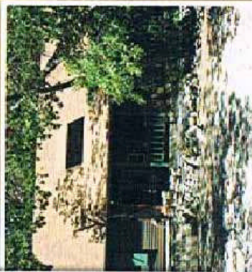
Lions Camp at Wrightwood